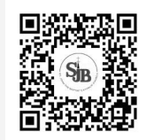
QR Code Scan to Donate

Adult / Youth / Plate - $26,225.47 Parish Improvement - 404.00 $26,629.47 Spanish Mass $143.00 Total to date for December $26,772.47 St. Vincent de Paul 2 nd Collection $3625.95