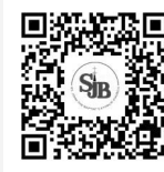
QR Code Scan to Donate

Thank you for your 2023 contributions to St. John's!