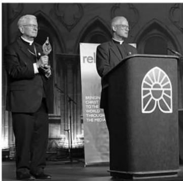
Bishop Ricken with the relic of St. Faustina.

Were in attendance at the National Eucharistic Congress.