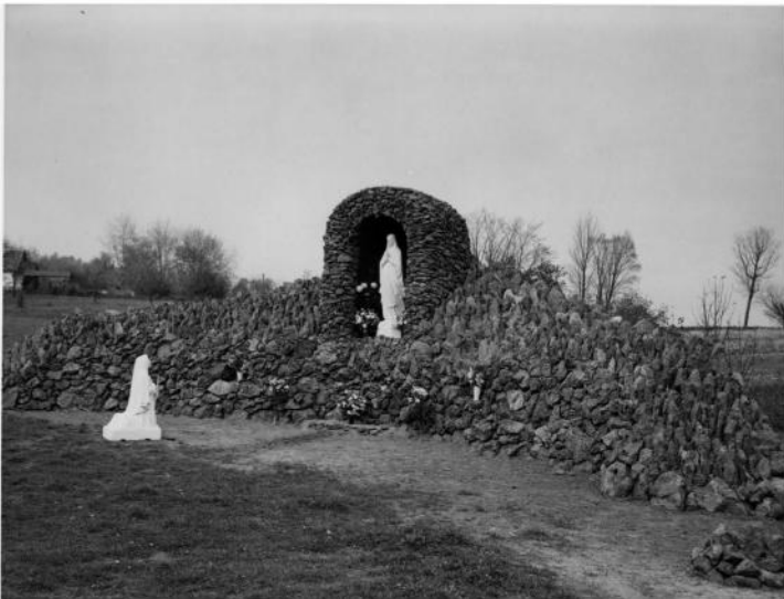
Original location of the statues was on the north side of St. Joseph Hospital. This picture, taken in 1954, was provided to us from the archives of the Sisters of the Sorrowful Mother.