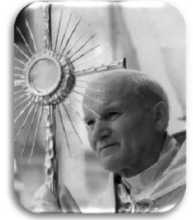
Pope Saint John Paul II

"Jesus Himself is calling you to spend one special specific hour with Him each week"