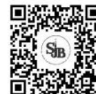
QR Code Scan to Donate